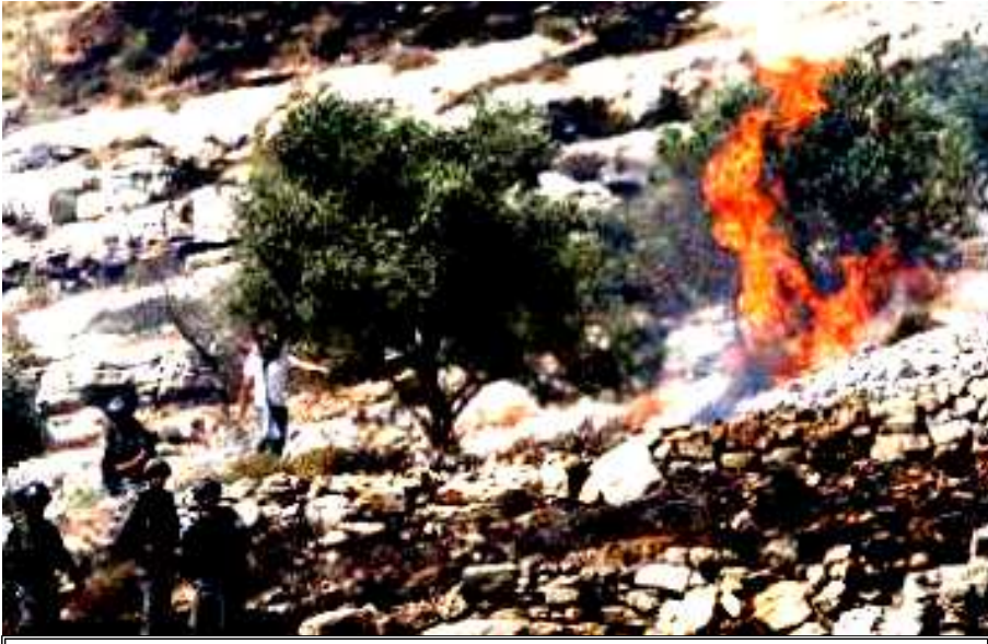
B'Tselem witness and AFP journalist

Armed settlers from the Jewish settlement of Yitzhar stand on a cliff overlooking the Palestinian village of Urif (Orif), south of Nablus in the northern West Bank, during confrontations following the setting on fire of Palestinian owned fields of grain and olive trees by settlers on May 26, 2012. Some settlers opened fire at Palestinian villagers, one of whom was gravely wounded and taken to hospital.