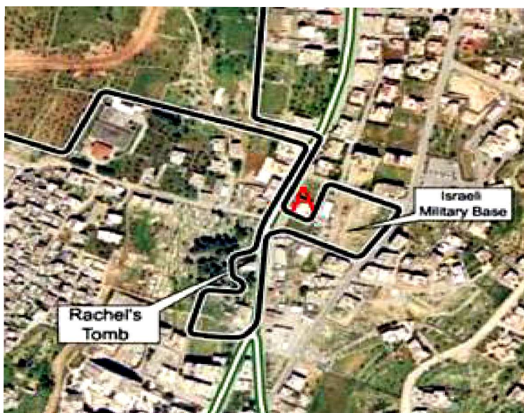
The route of the wall through Bethlehem, keeping Rachel's Tomb and an Israeli military base within Israel

Last Christmas the Archbishop of Westminster prayed for the community in "their legal battle to protect their land and homes from further expropriation by Israel," saying "Over 50 families face losing their land and their homes." The economic impact of the wall has caused many families to leave. The court is expected to pronounce by the end of the year. (The Universe & Huffington Post, 25.11.12; Guardian, 4.10.12)